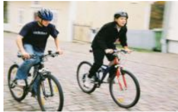
The road use