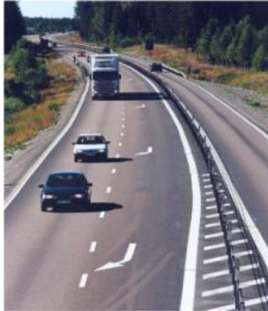
The roads and streets